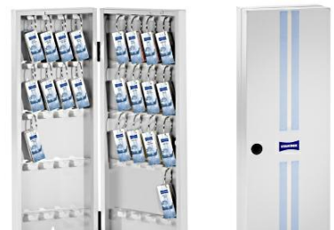
Standex Accent Colour Box