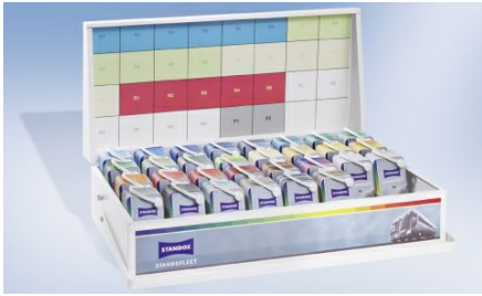
Standomix Colour Box for Standofleet