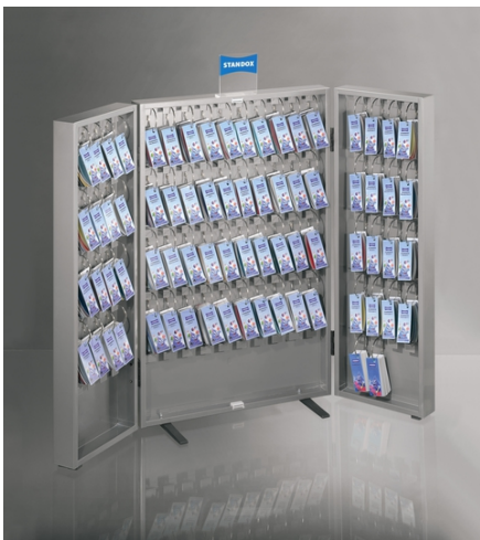
Standohyd Colour Box