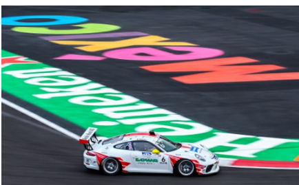
In the 2019 season, the Fach Auto Tech team will once again take part in the Porsche Supercup races. Here are pictures from Monaco, Monza and Mexico City.