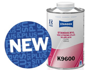
The new Standocryl VOC-Xtreme-Plus Clear K9600

Excellent processing properties, such as flexible application in 1.5 or 2 coats, good filling capability and excellent vertical stability deliver a perfect finish. Another 'plus' is its stellar drying performance – especially at low temperatures – which increases vehicle throughput and significantly reduces energy consumption. Altogether, it's a glimpse of the future, today!