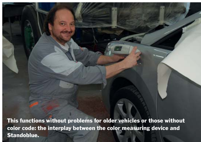
This functions without problems for older vehicles or those without color code: the interplay between the color measuring device and Standoblue.

Industriousness, endurance, purposefulness, perseverance and quality consciousness – those are, if you will, the "little" secrets for the success of the Carrosserie Neuenhof AG in Neuenhof in the Aargau near Baden.