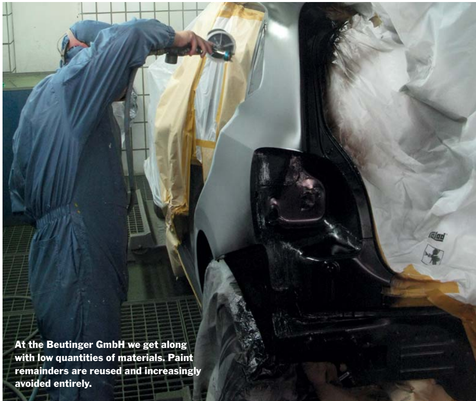
At the Beutinger GmbH we get along with low quantities of materials. Paint remainders are reused and increasingly avoided entirely.

The topic of color plays the central role at Theo Beutinger GmbH