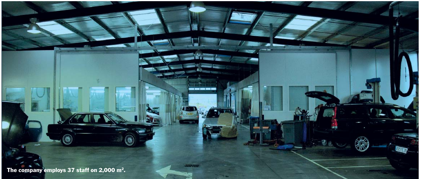
The company employs 37 staff on 2,000 m 2 .

The Métiffiot car body company in a suburb of Valence (26) is viewed as a model plant. The long-established family-owned company moved five years ago into a small automotive city, where it set itself up on an area of 6,000 m 2 . (...) On a covered area of 2,000 m 2 , 37 employees work in the car body and maintenance area, which looks after 30 to 35 repair orders daily, of which approximately 20