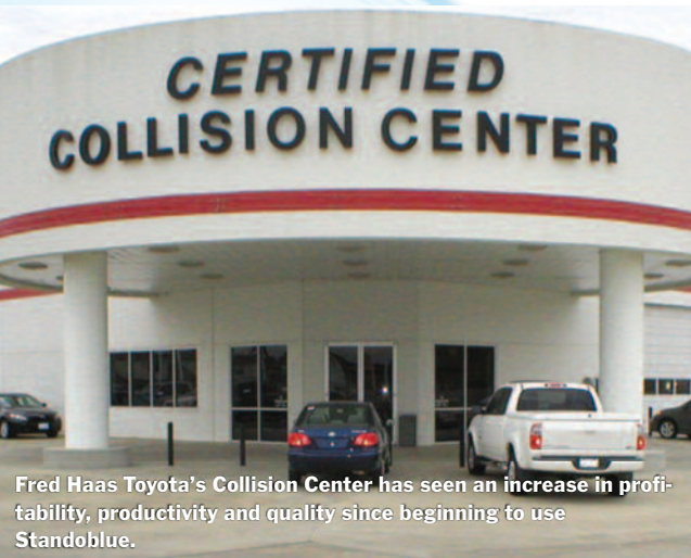
Fred Haas Toyota's Collision Center has seen an increase in profitability, productivity and quality since beginning to use Standoblue.