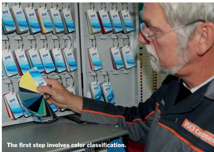
The first step involves color classification.

The Standoblue base coat system is conquering Switzerland