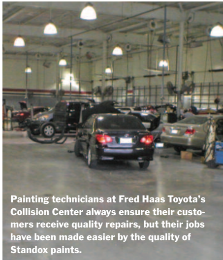
Painting technicians at Fred Haas Toyota's Collision Center always ensure their customers receive quality repairs, but their jobs have been made easier by the quality of Standox paints.