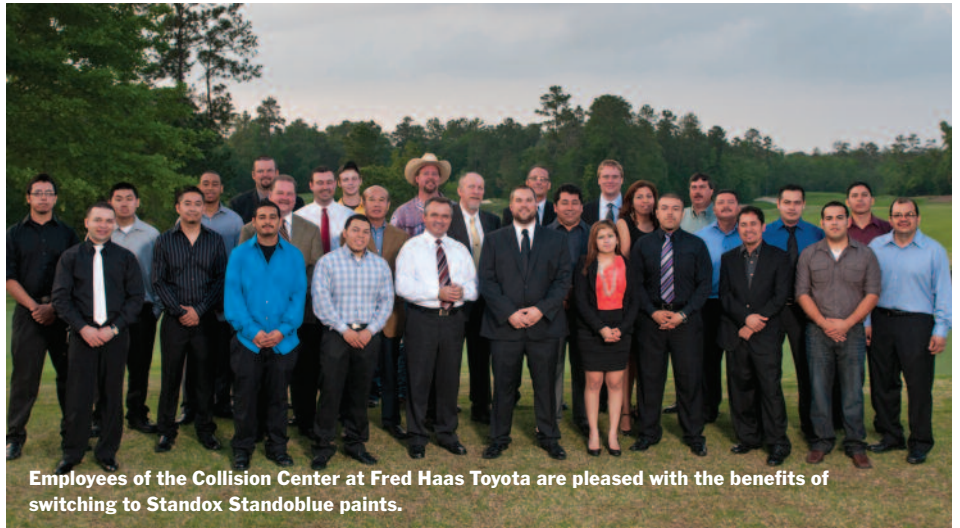
Employees of the Collision Center at Fred Haas Toyota are pleased with the benefits of switching to Standox Standoblue paints.