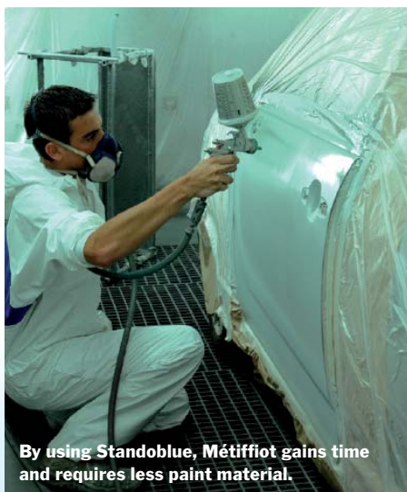
By using Standoblue, Métiffiot gains time and requires less paint material.

(...) Today the operations have an annual turnover of 3.8 million Euros, of which 70 percent originate from the car body area. "The working conditions are growing increasingly more difficult, especially due to the pressure being applied by insurers. Nonetheless, we have to adapt by making use of all means to increase our performance", he continues. One solution is the usage of the new Standoblue base coat system from Standox. (...) After six months the decision makers of the car body operations are not yet able to precisely estimate the returns of the product. The product is in fact 15 to 20 percent more expensive. At the same time "we save time and space for repairs. We require less paint and usage is simpler, even though another process is required", he emphasises. This example demonstrates the importance of the right paint for the productivity of a shop. (...)